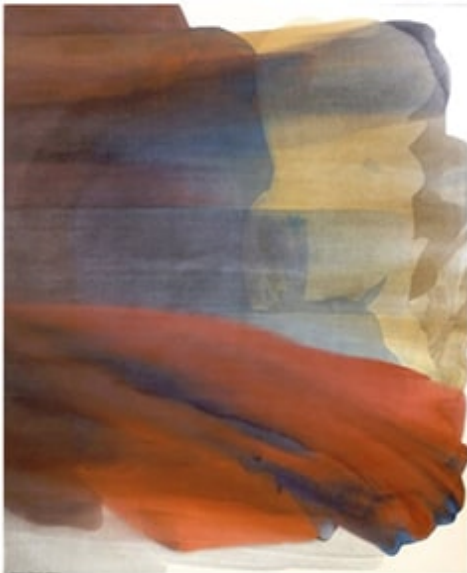
Hollis Taggart Irene Monat Stern: Air of Twilight October 10–31, 2018