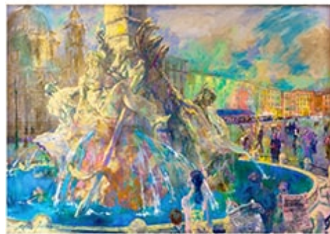
Franklin Bowles Galleries LeRoy Neiman: Pop Culture October 1–31, 2018