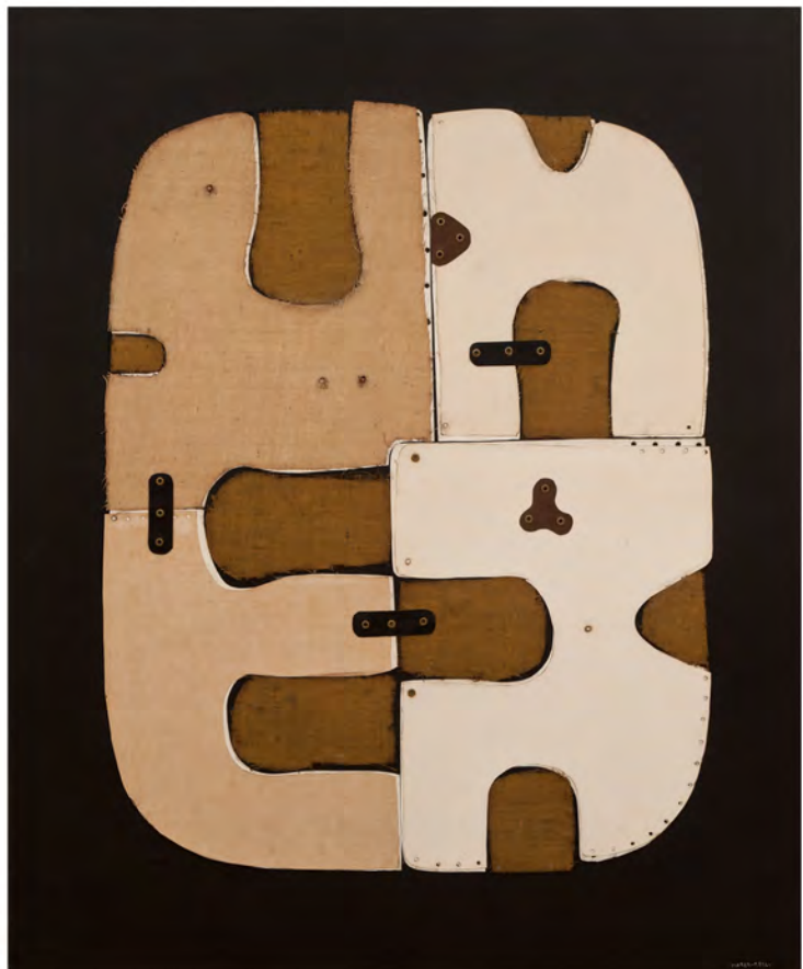
X-L-20-70 , 1970 Collage on canvas 69 1/8 (H) x 57 (W) x 1 1/2 (D) inches