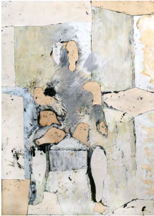
Seated Figure Outdoors , 1953 Oil and collage on canvas 21 1/4 x 15 inches