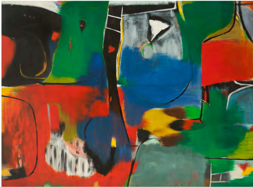
Untitled, circa 1949-50 Oil on canvas 60 x 80 inches