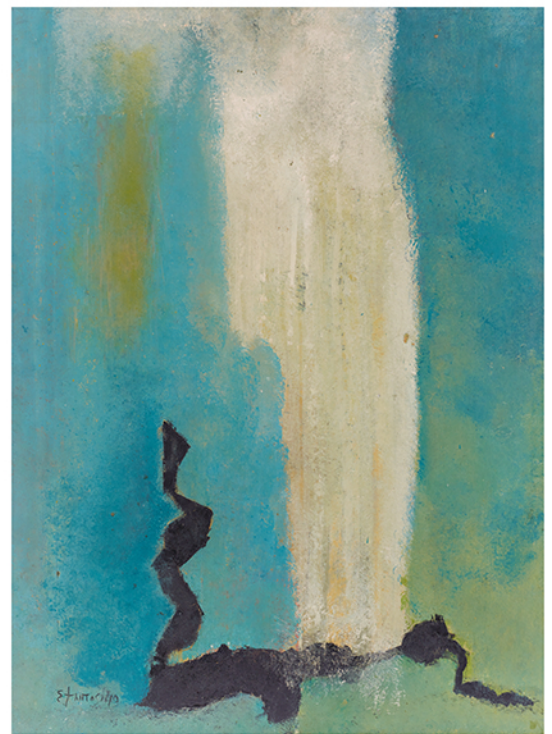
A Day , 1949, Oil on Masonite, 24 x 18 1/8 inches

Theodoros Stamos: Contemplations on the Universal will be accompanied by a fully illustrated catalogue including a new essay by noted curator and art historian Jeffrey Grove. Grove's