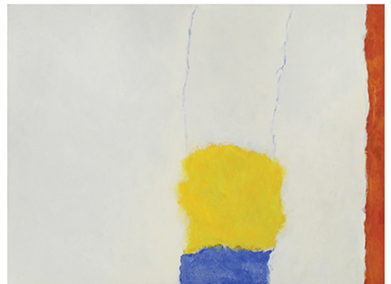
Classic Boundaries #3 , 1964, Oil on canvas, 36 x 48 inches